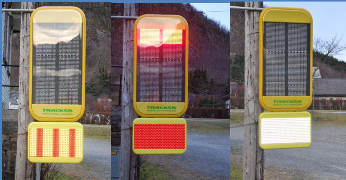
LIGHT Panel, with SLIPPERY flag