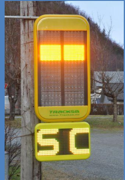
LIGHT Panel, with SC Board