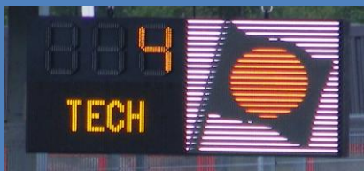
Main Post, show tecn.,black, warning, blue, slippery and finish, lap counter. Flag in text and graphics.

Take a look at our web site for more information regarding the remote control, race control and other solutions from your world leading safety supplier. www.tracksa.com